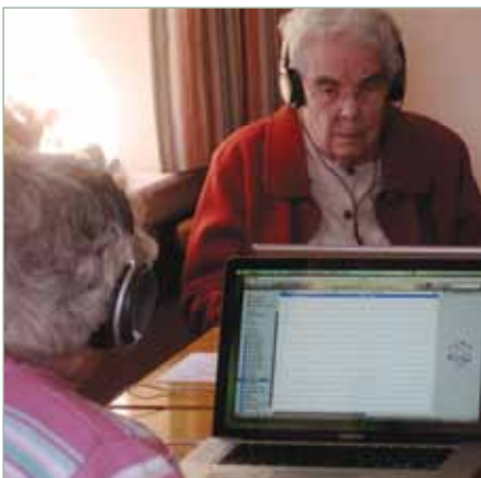
various images from the soundings project