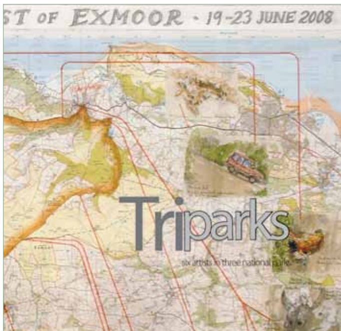
front cover of our Triparks publication