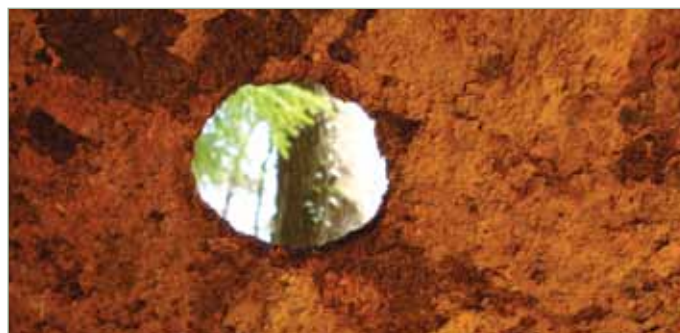
during filming on the River Tamar (Mining Landscape)